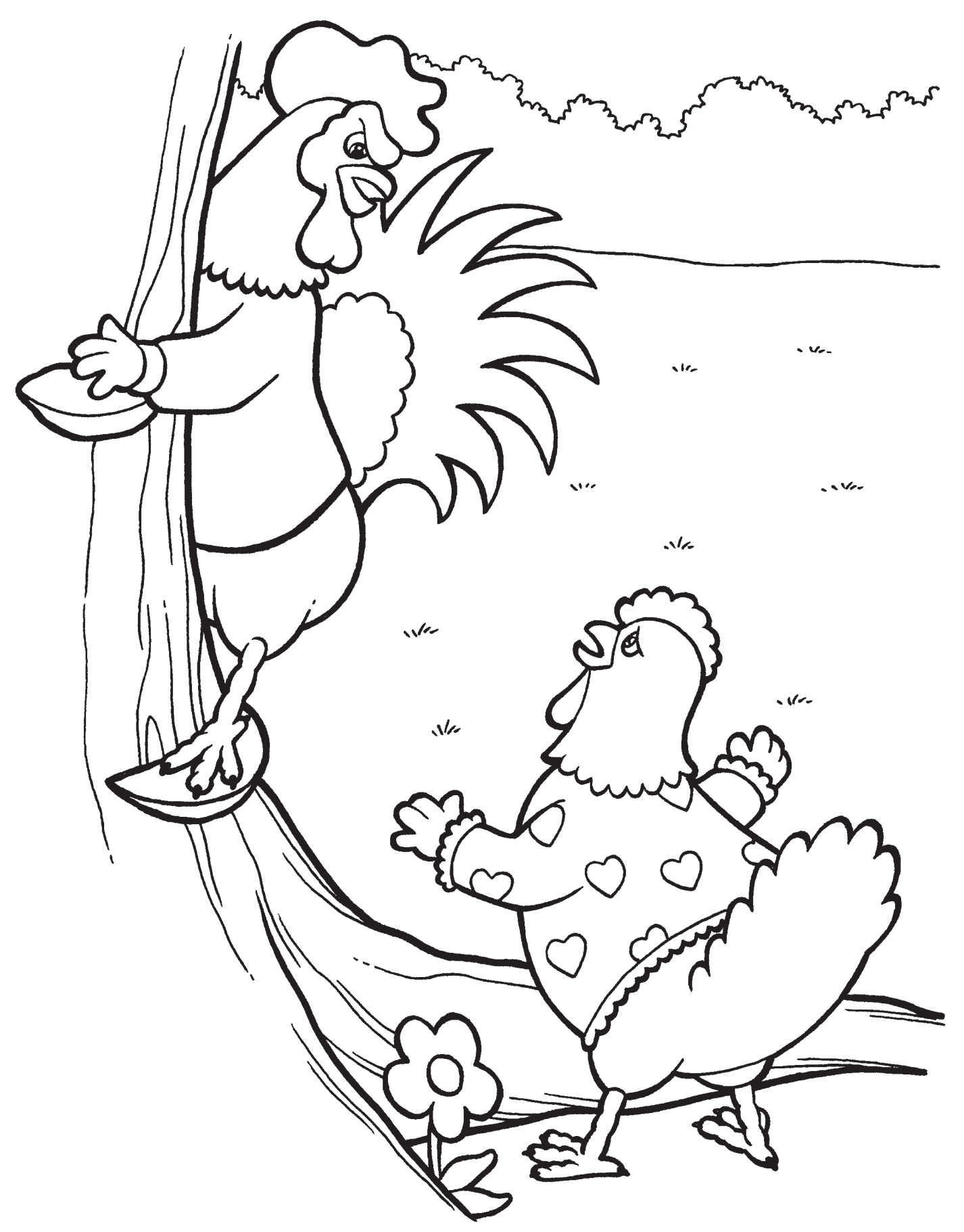
"Be careful," called Little Hen.