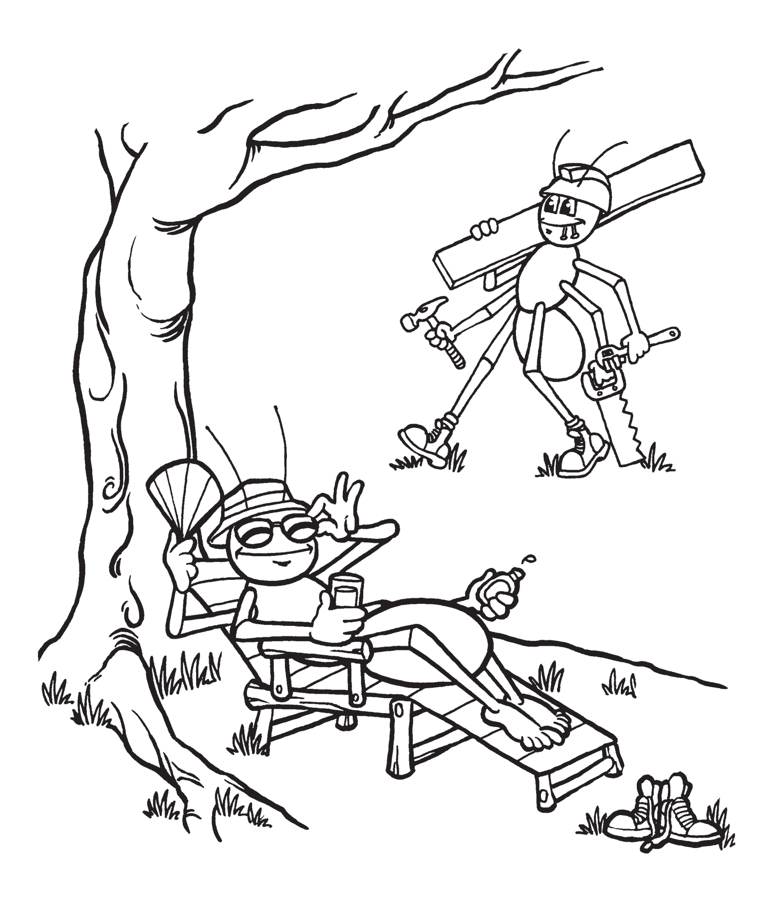
Papa Dilly Dally and Papa Work Play