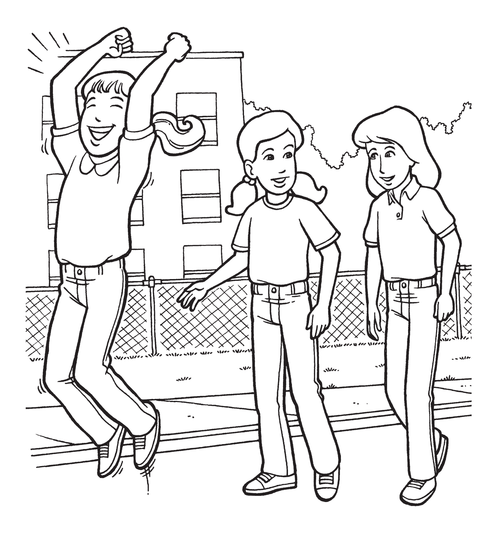
"Yippie!" We're lighting candles!"