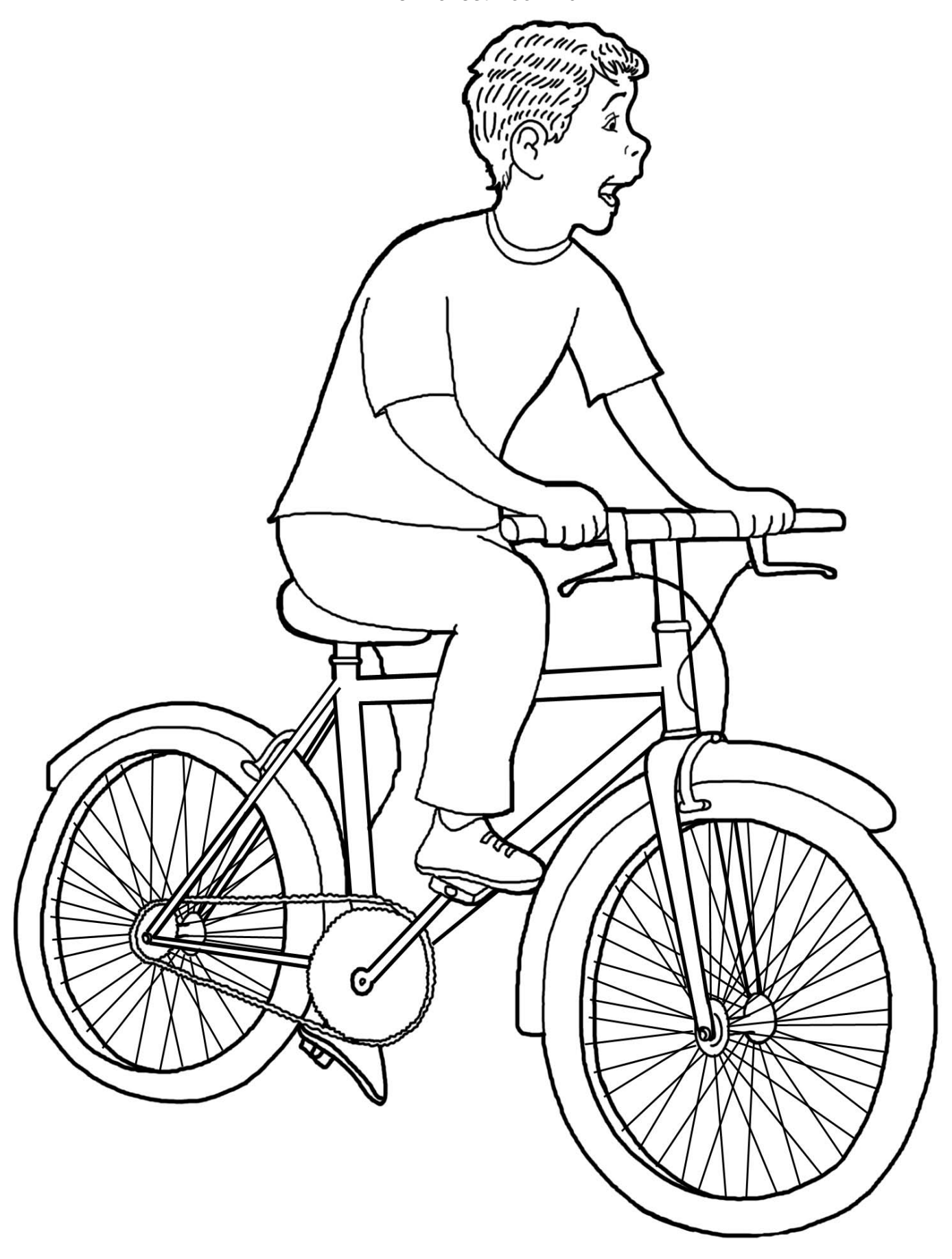
Be Thankful for What You Have