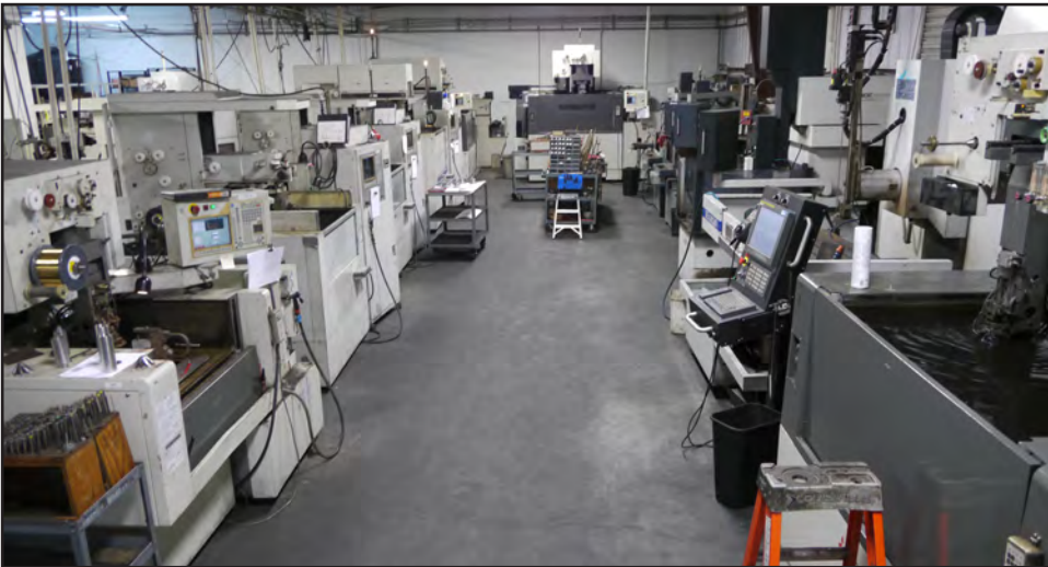
One of Reliable's Wire EDM Departments