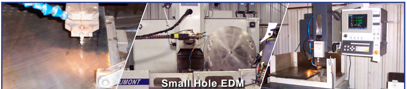
Small Hole EDM

Reliable EDM: Specialists in Wire, Ram, and Small Hole EDM