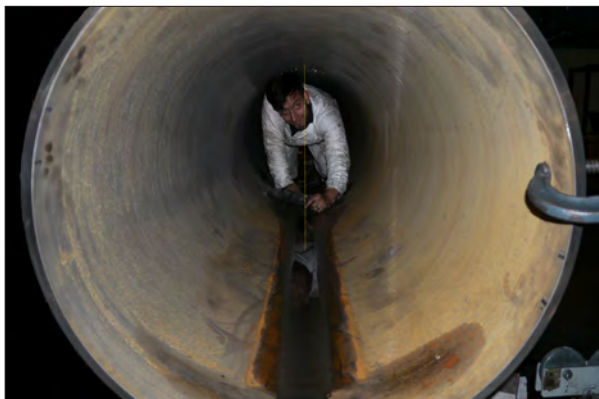
Modified Wire EDM Machine Split Large Tube Diameter 27 Inches, Length 16.5 Feet.