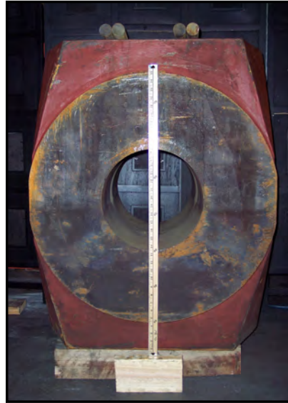
Test Specimens for Blowout Preventer: 40 inches (1016mm)

Reliable EDM does various kinds of work for aerospace, defense, petroleum, plastics, electronics, medical, and many other industries.