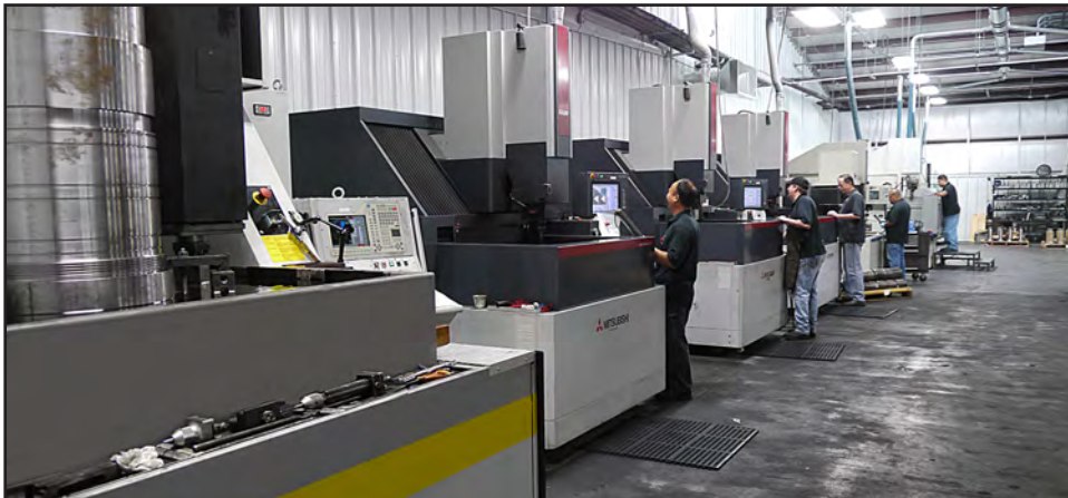
Part of Reliable's Ram/Sinker EDM Departments